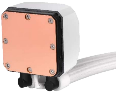
High Performance Water Block