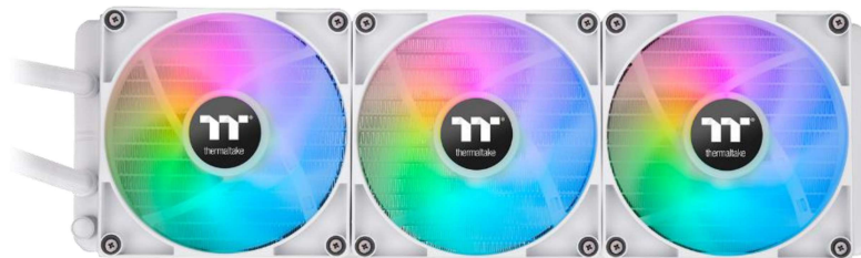
Powerful Cooling Fan